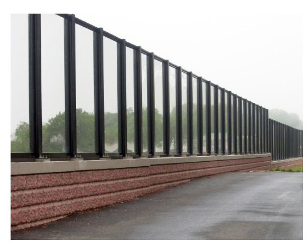
RT18 NEW BRUNSWICK, NJ