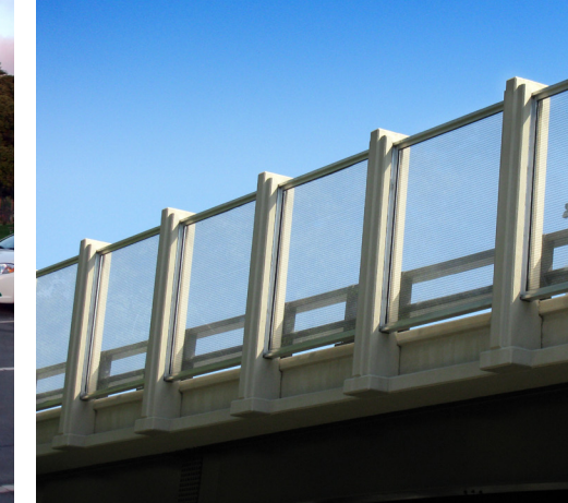
NEWPORT BEACH, CA CROSSTOWN, MN