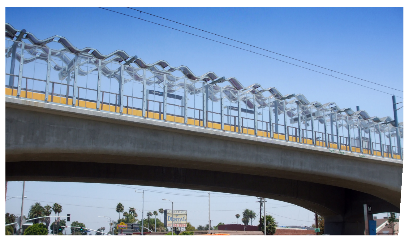
LOS ANGELES, CA