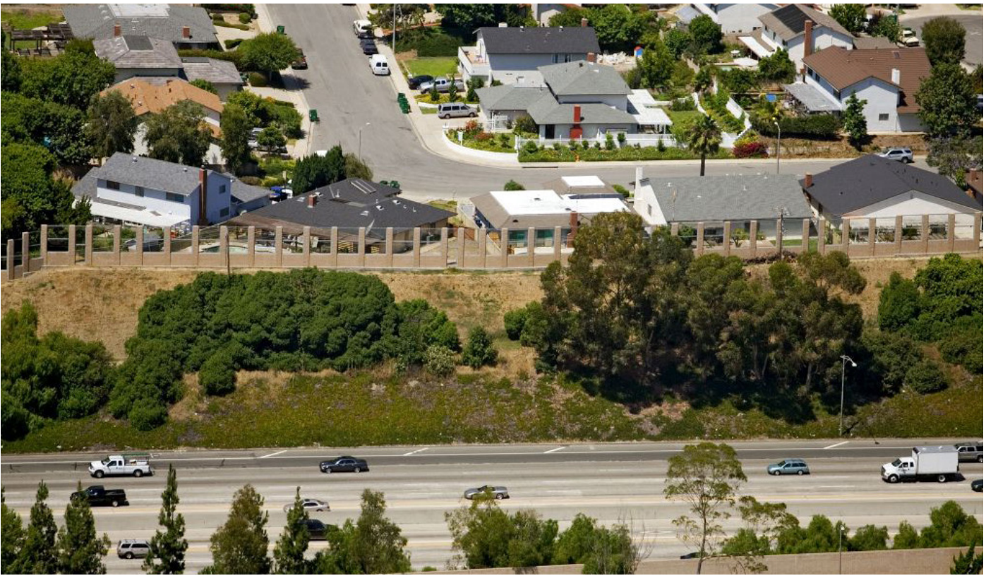
MISSION VIEJO, CA