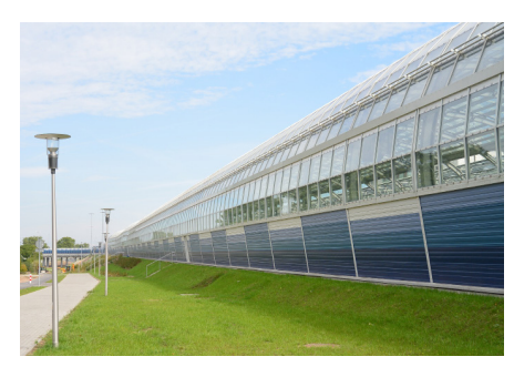
ALUMINUM WITH TRANSPARENT STACKED PANELS